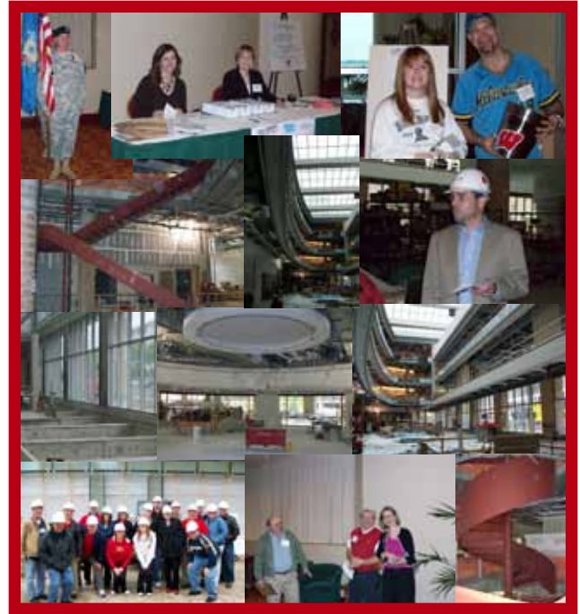
Candid Shots from Tri-Chapter Event

The education committee is pleased to announce the rebranding of our committee name. Our new name is "Board of Education." Our team is currently working on a logo and mission statement. There will be more information available in the coming months. We are also working on educational opportunities for the remainder of the year which will be published in the next month.